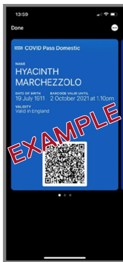
Apple Wallet Download