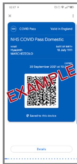
Google Wallet Download