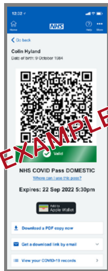
Open on Screen